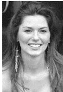
Some of Canadians' favourite things, from top to bottom: A 'two-four' of beer, a canoe, former prime minister Pierre Trudeau, left, and singer (Shania Twain).