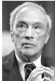
Some of Canadians' favourite things, from top to bottom: A 'two-four' of beer, a canoe, former prime minister (Pierre Trudeau), left, and singer Shania Twain.

And how about this: The second most "Canadian" term, after "eh?" is "two-four." As in: "Strap that two-four to the back of the Ski-Doo, eh?"